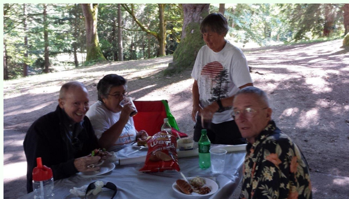
Some of the picnic attendees enjoying the food and friendship.

People enjoyed great food and nice weather at Woodland Park during Dignity/Seattle's Annual Summer Picnic. More on page 4.