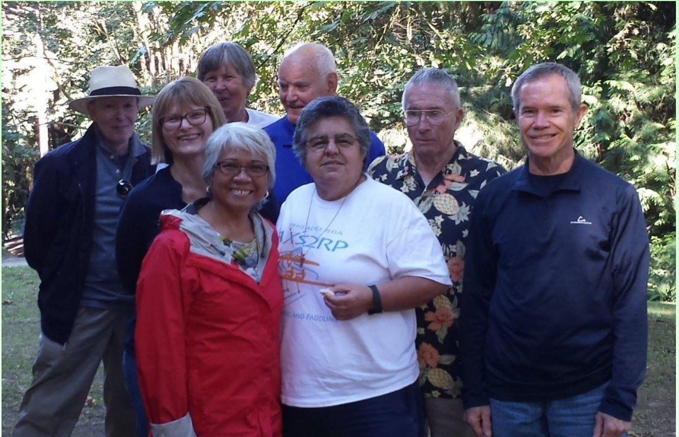
Dignity/Seattle's Summer Picnic attendees at Woodland Park, July 23, 2016