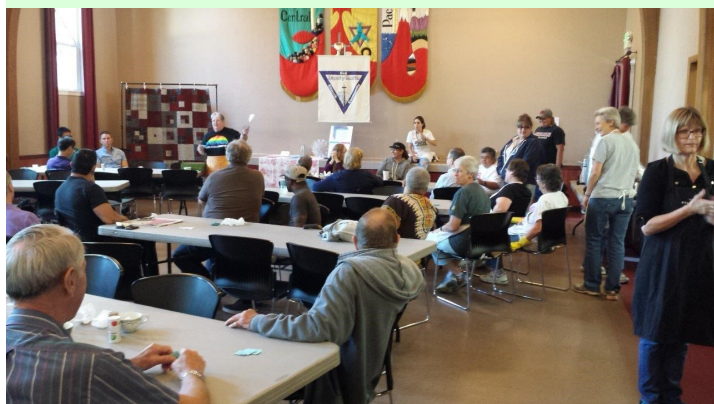
Enjoying breakfast on Saturday, June 25.

Thanks to your generosity and hard work, Dignity/Seattle is happy to announce that proceeds from the 28th Annual Pride Week Breakfast will be donated to the following: $655 for CareTeams—a Program of Samaritan Center, $655 for Plymouth Healing Communities, and $647 into the Dignity Convention Scholarship Fund. More details and photos are on page 3.