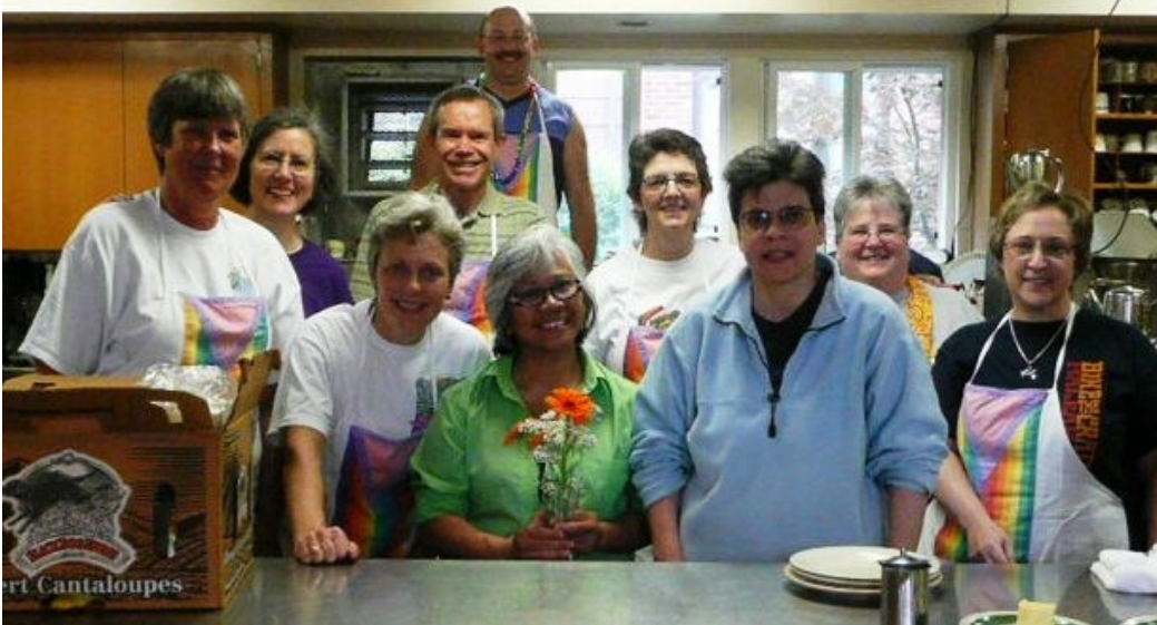
The hard-working kitchen and dish-washing crew at the Pride Week Breakfast, Saturday, June 26