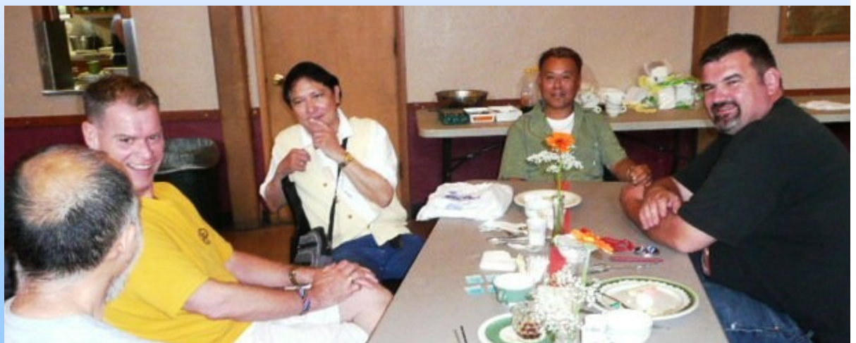
People socializing at the Pride Week Breakfast