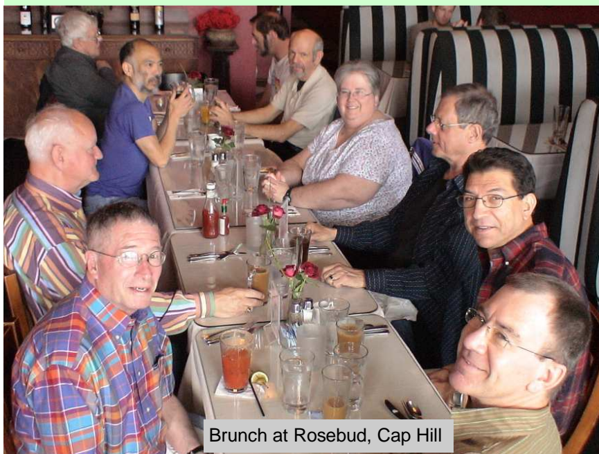
Brunch at Rosebud, Cap Hill